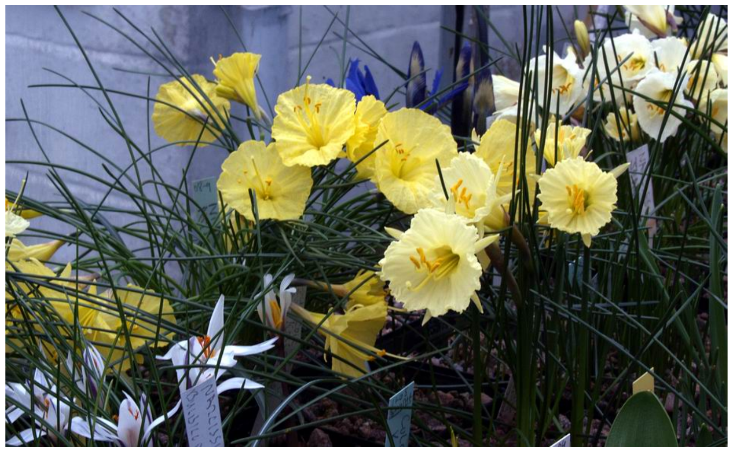
Jumble of Narcissus

Many pots of Narcissus are in full flower just now as the early spring flowering hoop petticoat forms reach their peak.