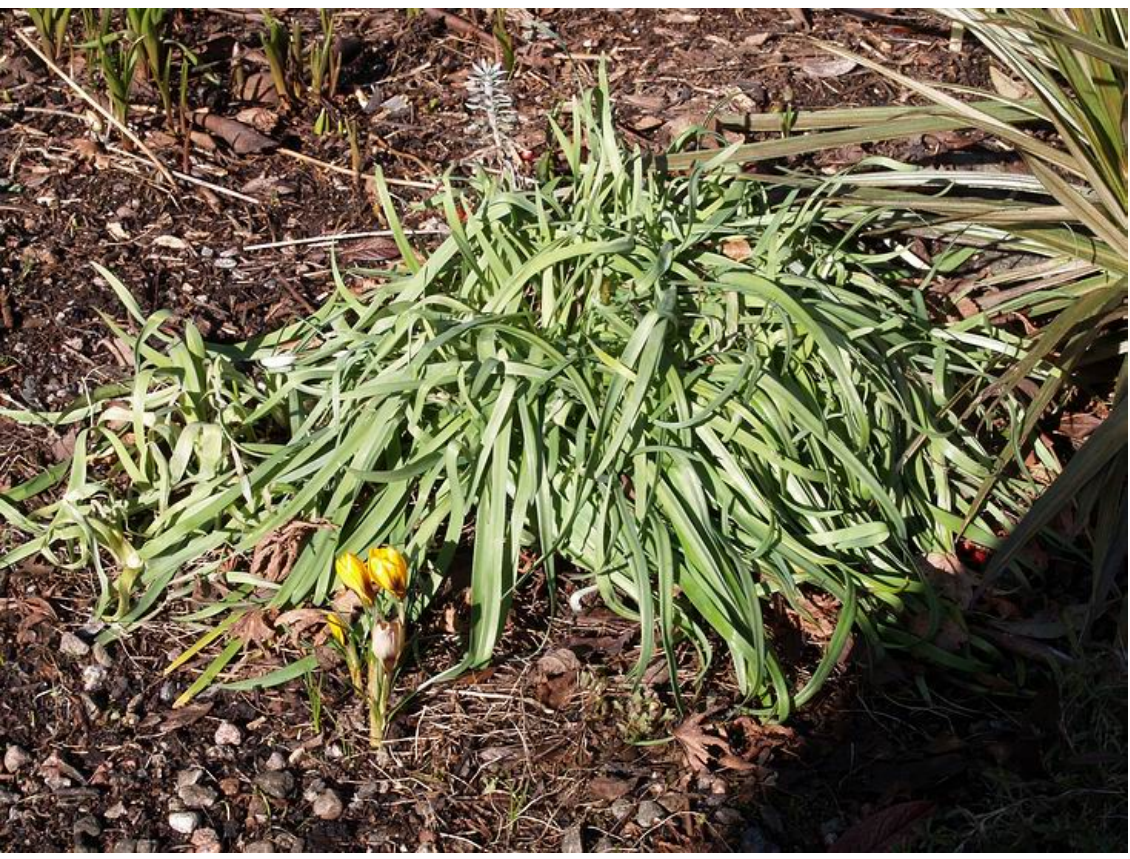
Ipheion 'Alberto Castillo' leaves