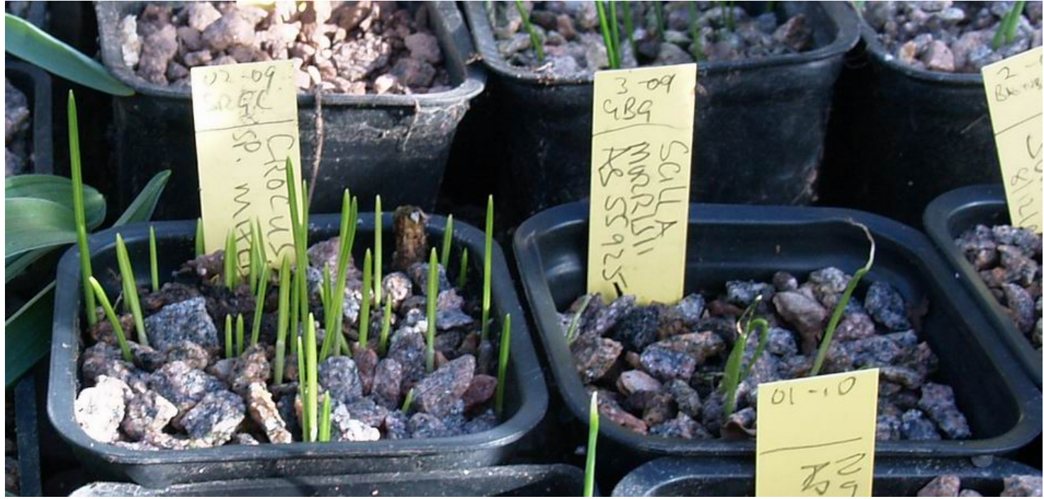
Newly germinating bulb seeds

Watering newly germinating bulb seedlings is slightly different – the same basic rule outlined above applies but you have to realise that the young seedlings have not got the same ability to withstand being dry for any length of time. Their roots do not penetrate far into the compost and they have not built up much of a reserve in the form of a bulb yet so I do have to water them on good days. I always water them early as soon as the sun hits the bulb house and raises the temperature above freezing so that the surplus water drains away before night fall. One good watering will last the seedlings for around two weeks in our conditions at this time of year. This only applies to the pots of seedling that are in the bulb houses – other pots are still in open frames and they do not need me to water them at all as nature does that for me – I only have to watch out for slugs and snails.