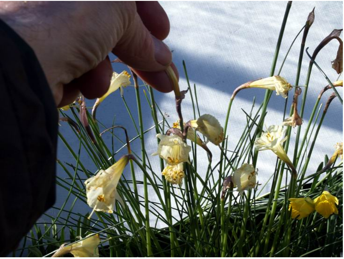
Removing dead flowers

One job that is always essential is the removal of dead flowers before they become infected by grey mould in cold damp conditions. I do this by holding the flower and plucking upwards. I do not use a knife, scissors or even my finger nails to cut the stem as that can lead to cross infection of any latent virus between plants.