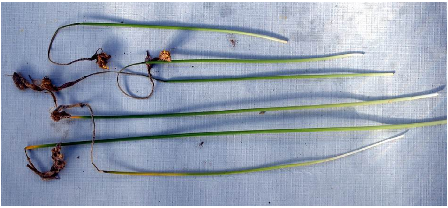
Narcissus stems with mould

One job that is always essential is the removal of dead flowers before they become infected by grey mould in cold damp conditions. I do this by holding the flower and plucking upwards. I do not use a knife, scissors or even my finger nails to cut the stem as that can lead to cross infection of any latent virus between plants.