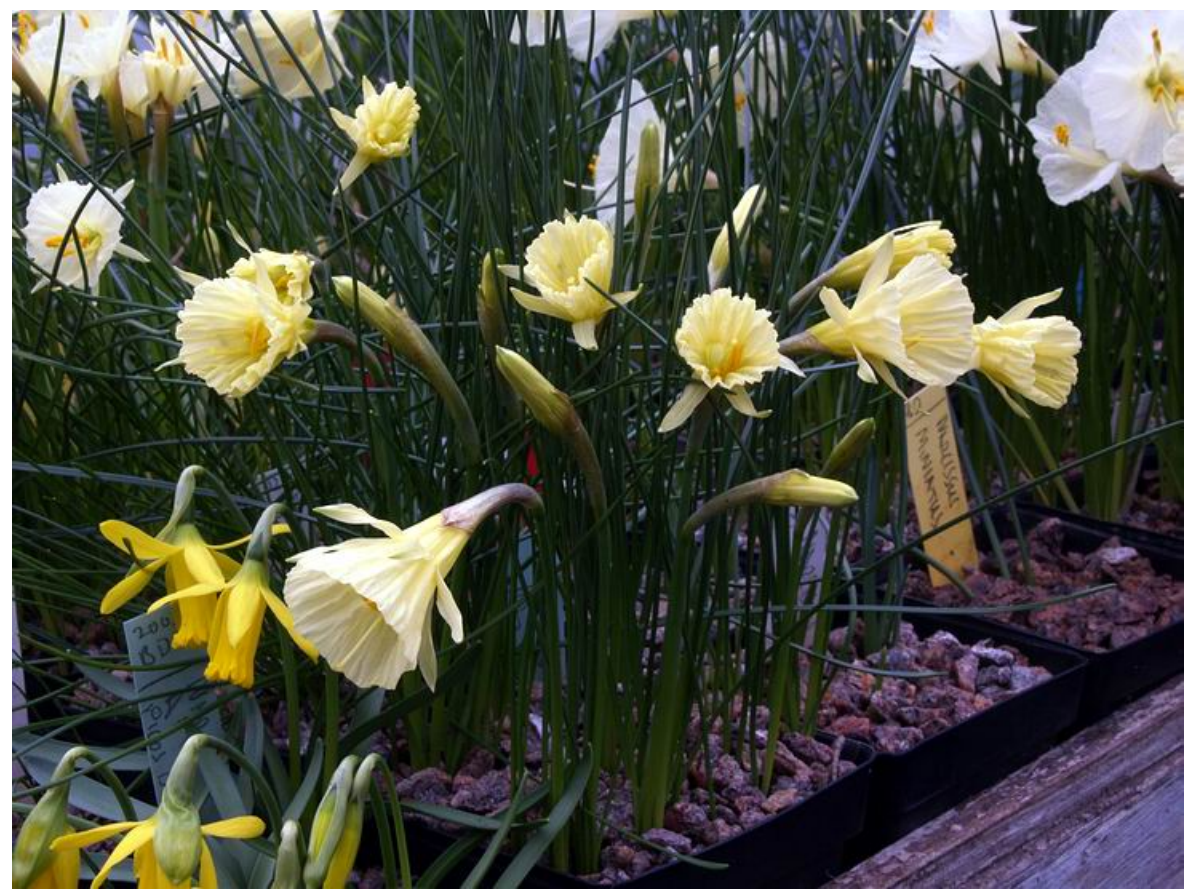
Narcissus bulbocodium x romieuxii

I have a number of pots raised from seedlings that have sown themselves into the sand plunge which I am sure are hybrids between Narcissus bulbocodium and N.romieuxii. They are increasing well and are very attractive plants.