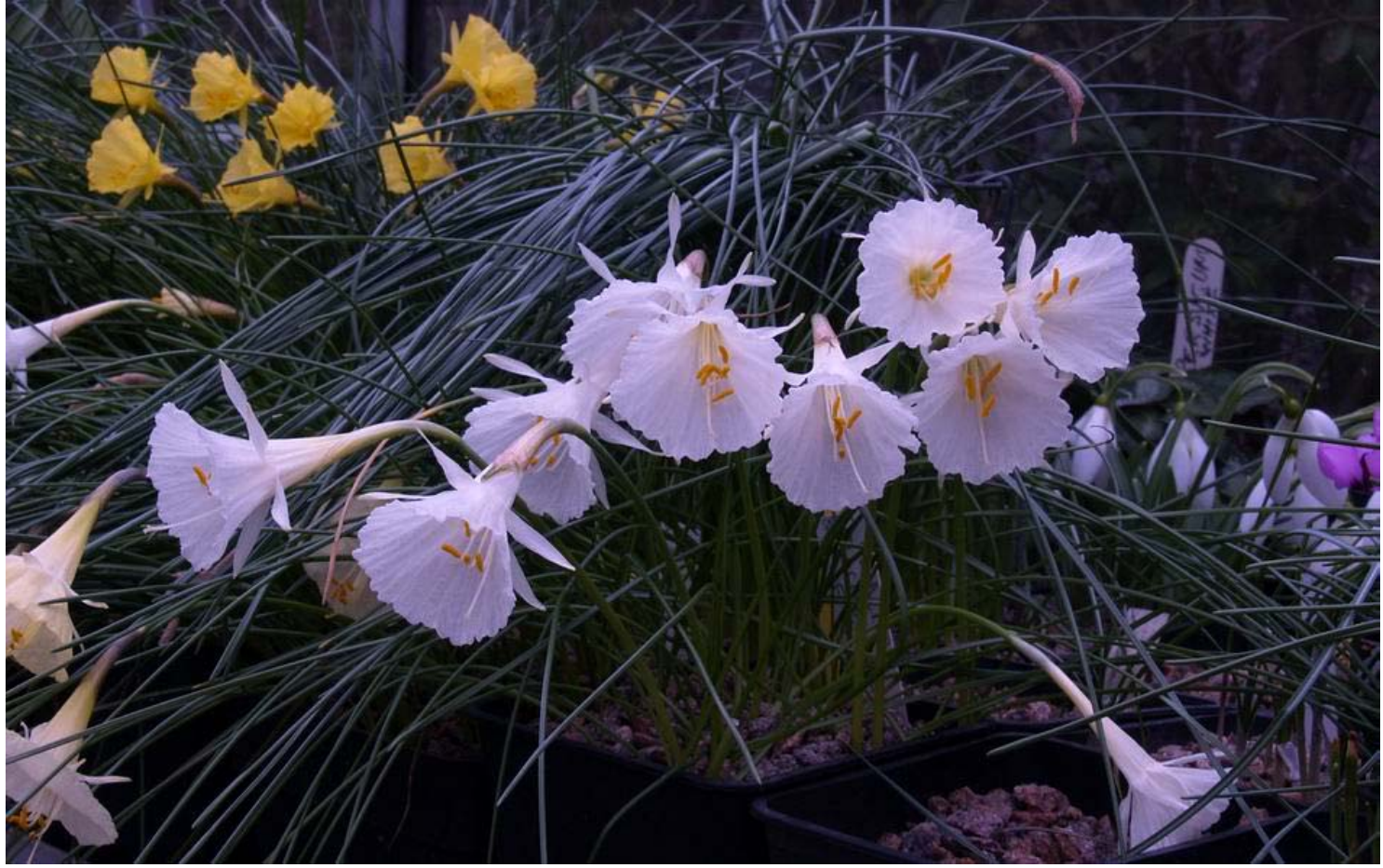
Narcissus albidus occidentalis

It is always a great highlight for me when Narcissus albidus occidentalis flowers as it is such a perfectly formed flower with a beautiful scent to add to my pleasure.