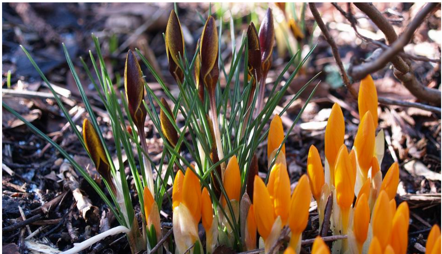
Crocus herbertii and Crocus korolkowii seedling

In the foreground is the bright egg yolk yellow Crocus gargaricus ssp herbertii, now elevated to species status and should be called Crocus herbertii, runs around by stolons. However I want to show you the dark Crocus korolkowii type behind that self seeded in a gravel path a number of years ago. Once it had reached flowering size I decided it was very attractive and worth moving to reduce the danger of it getting trampled on so I replanted it into a humus bed where it is now clumping up nicely.